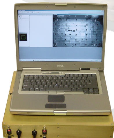
Laptop with controller

The features of this powerful combination include: